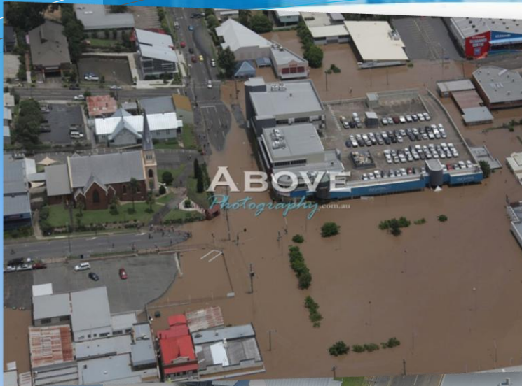
12 th Jan 2011