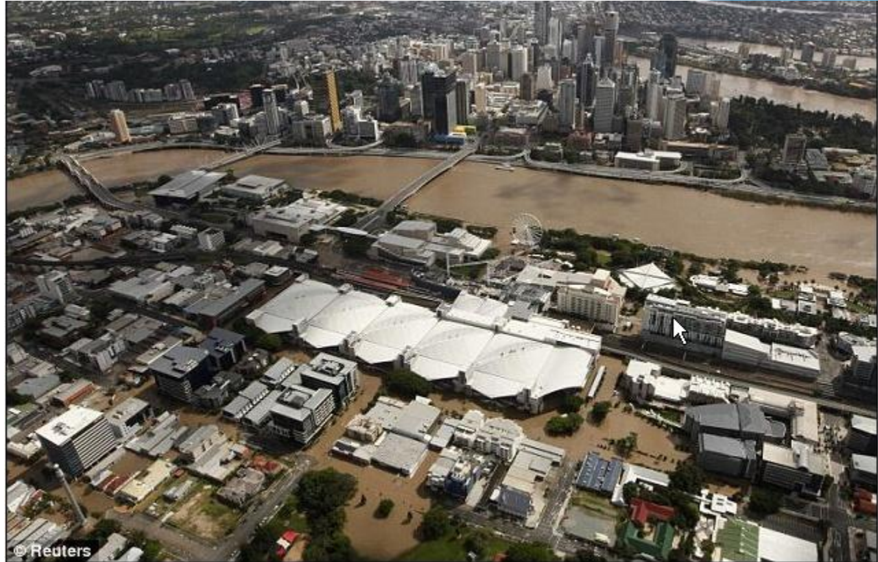
Convention & Exhibition centre and surrounding commercial area