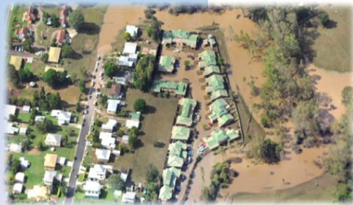
13 th Jan 2011