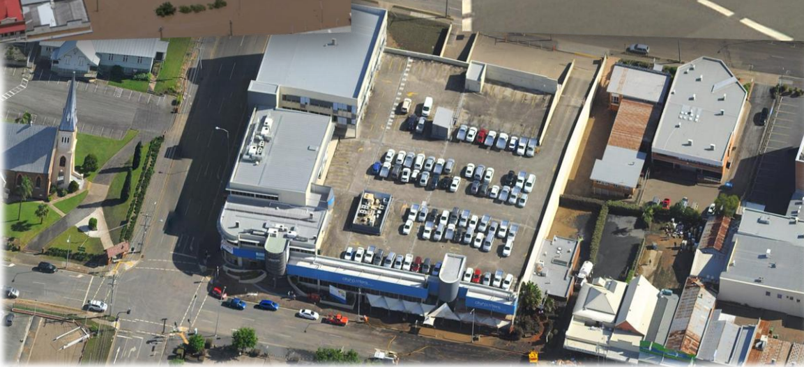
13 th Jan 2011