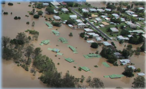
12 th Jan 2011