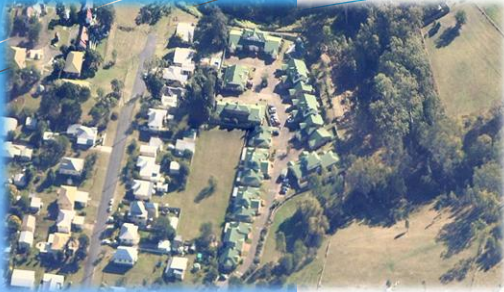
11 th Aug 2009