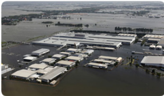
Aerial footage of flooded Honda Car Factory, Central Thailand, October 2011